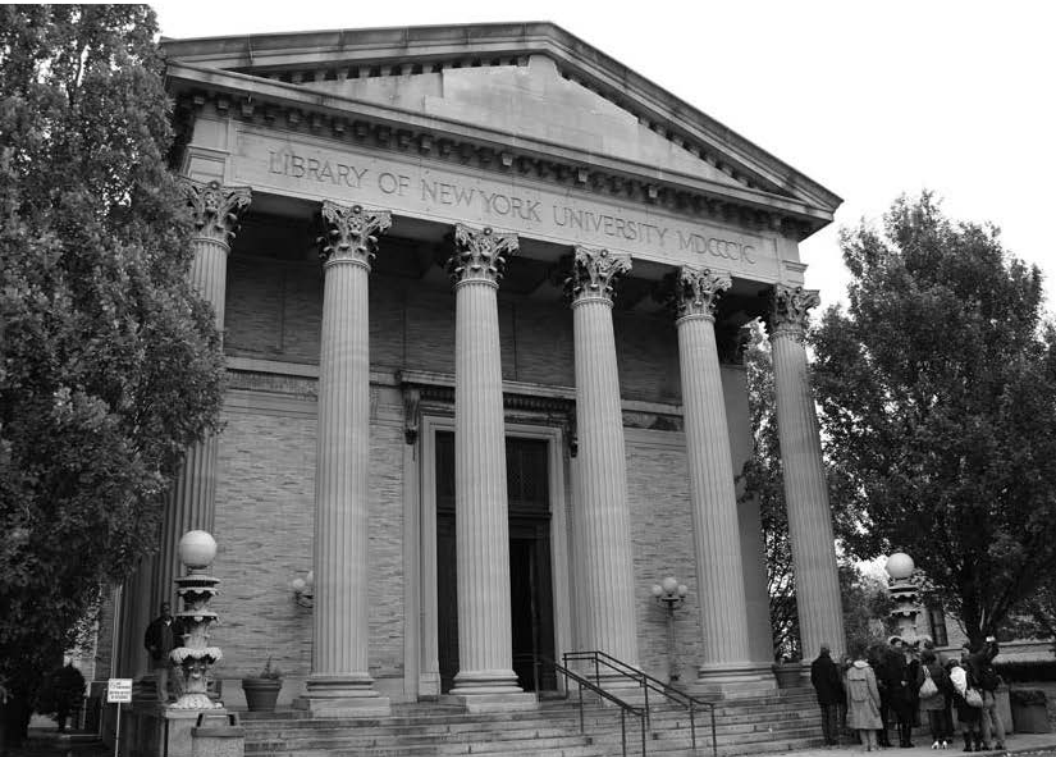
The Gould Memorial Library, one of the original University Heights campus buildings, completed in 1900.